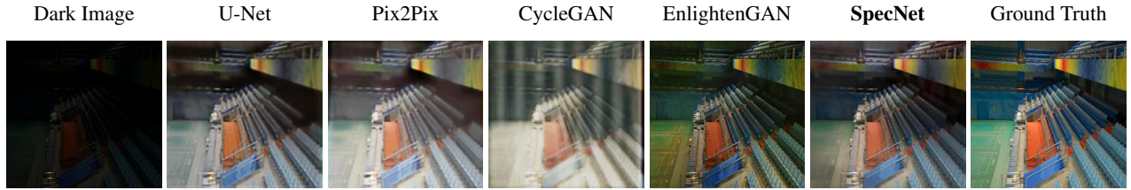
Figure 3: Qualitative comparison for different models as described in Table 1.

be viewed as a cascaded GAN approach. The first GAN takes an unsupervised cycle-consistent approach to reconstruct HSI, which is fed into another cGAN to generate the final enhanced output image. To solve the under-constrained problem of HSI reconstruction we make use of several guiding principles such as task-aided supervision and spectral-profile optimization.